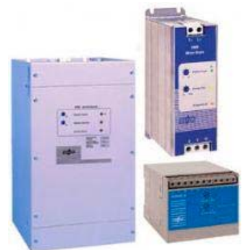
Solcon Soft Starters and Motor Protection Relays

GAMAK MOTORS LTD SUPPLIERS OF QUALITY ELECTRIC MOTORS