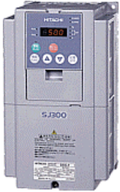
Variable Speed Drives