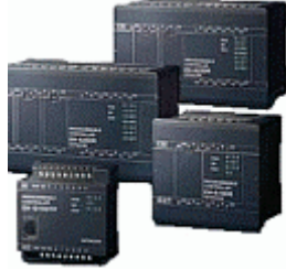
Programmable Logic Controllers