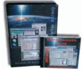
Drive Manager Software